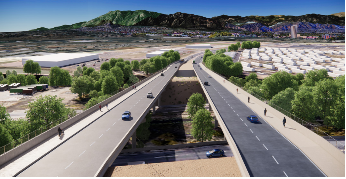
Above: a rendering of the completed project with new bridges, pedestrian and bicycle access.