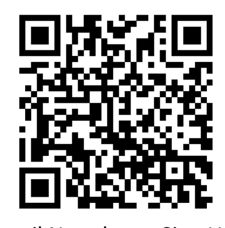
Email Newsletter Sign Up