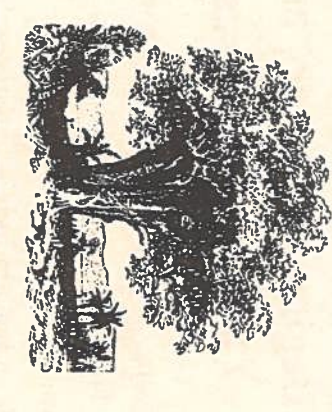
"Pibuyu" – The Baobab Tree THE TREE OF LIFE